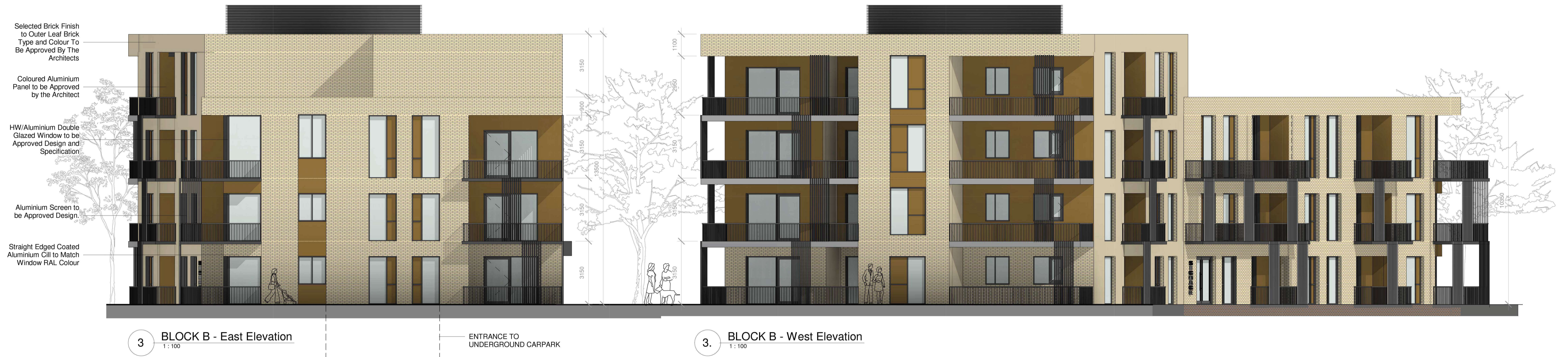
3 BLOCK B - East Elevation 1:100